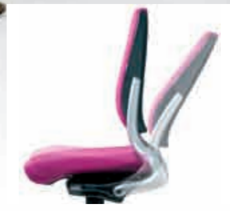
Moving while sitting with the synchro-mechanism: the back and seat move along. The spring force can be adjusted to the user's body weight and individual preferences for optimum comfort.