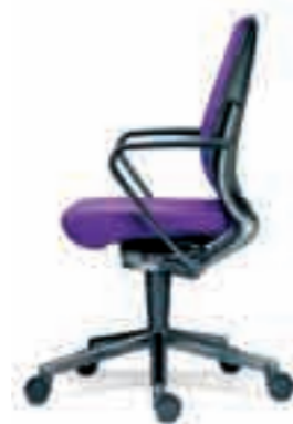
Back brackets aluminium Star base lacquered aluminium