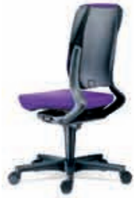
Extra high back Plastic back shell