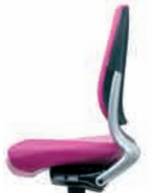
Ahrend 230 has a unique option with a tilting seat. The seat angle can be adjusted as required.