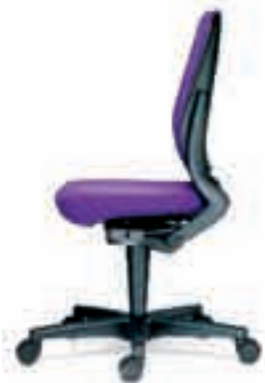
Back brackets plastic Star base soft black plastic