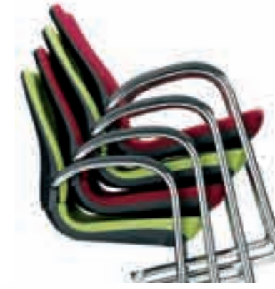
All models with or without armrests are available in stacking or non-stacking versions.

Sometimes meetings take longer than expected. At such times, sitting in a good position is important to avoid back and neck complaints. And don't forget, visitor and meeting chairs are used intensively by different people. That is why Ahrend 230 enables you to move while sitting thanks to the weight-independent movement mechanism. Tall, short, heavy or light – everybody is immediately seated perfectly.