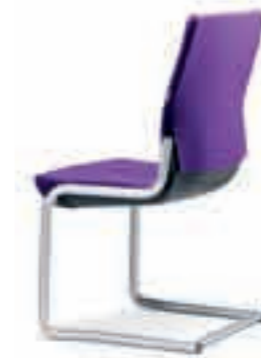
Armrests none Upholstered all round