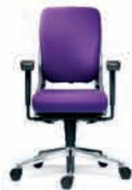
Armrests adjustable HBDD