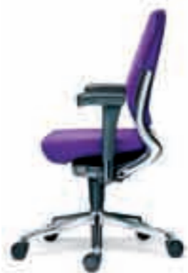
Back brackets polished aluminium Star base polished aluminium