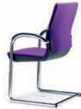
Armrests fixed Upholstered all round