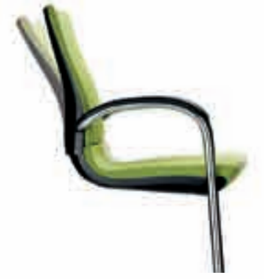
Chairs with a weight-independent movement mechanism exert a pleasant counterpressure on the user's back. The right chair for long and short meetings.