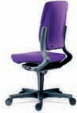
Extra high back Upholstered all round