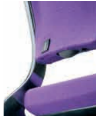
The lumbar support can be inflated using bellows.