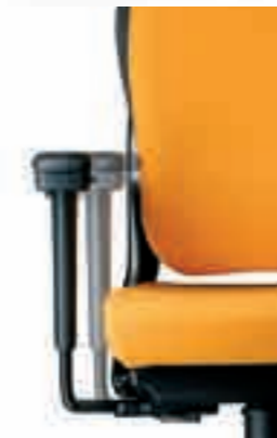
The chair can be fitted out with a special armrest for slightly built people: width-adjustable from 33 to 51 cm.

Because good arm support takes the load off the user's neck and shoulders, the armrests are adjustable: