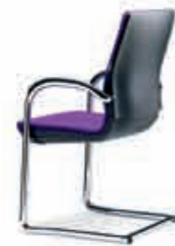
Armrests fixed Plastic back shell