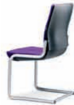
Armrests none Plastic back shell