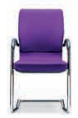
Armrests fixed Stacking