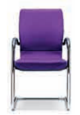
Armrests fixed Non-stacking