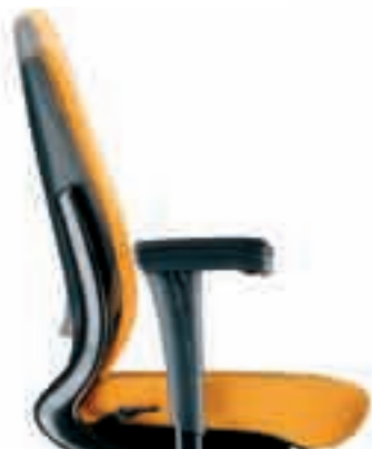
The back is height-adjustable (through 8 cm) by simply pushing a button. The back cushion is shaped to offer optimum spinal support.