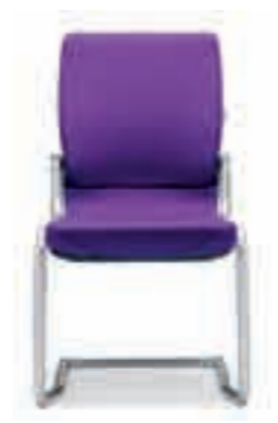
Armrests none Stacking