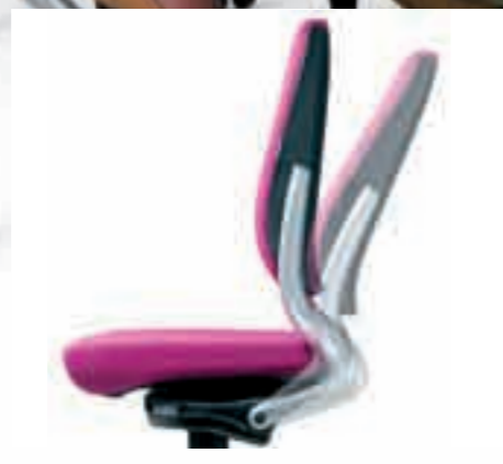
Permanent spinal contact: the user's back is optimally supported in all positions. The angle between the chair's back and seat can be adjusted to any required position. An anti-spring-back mechanism ensures smooth unlocking.