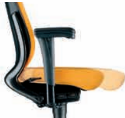
A good seat does not constrict the blood circulation in users' legs and is not too short either. Ahrend 230 is suitable for different lengths of leg: the seat can be moved forwards or backwards through an adjustment range of 11 cm.