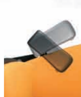
The soft armrests can rotate through 44 degrees inwards and 11 degrees outwards.