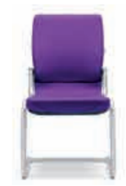
Armrests none Non-stacking