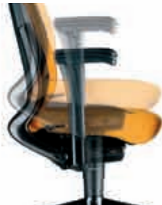
The seat height can be adjusted from 40 to 54 cm by means of a gas spring, whereas an extra suspension mechanism ensures good seating comfort even when the chair is in its lowest position. Tall people can choose an adjusting range of 44 to 57 cm.